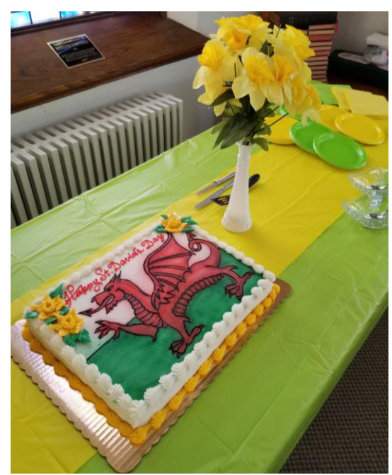
The Reception cake