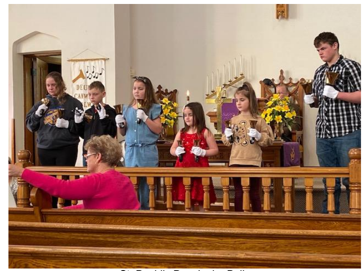
St. David's Day Junior Bells