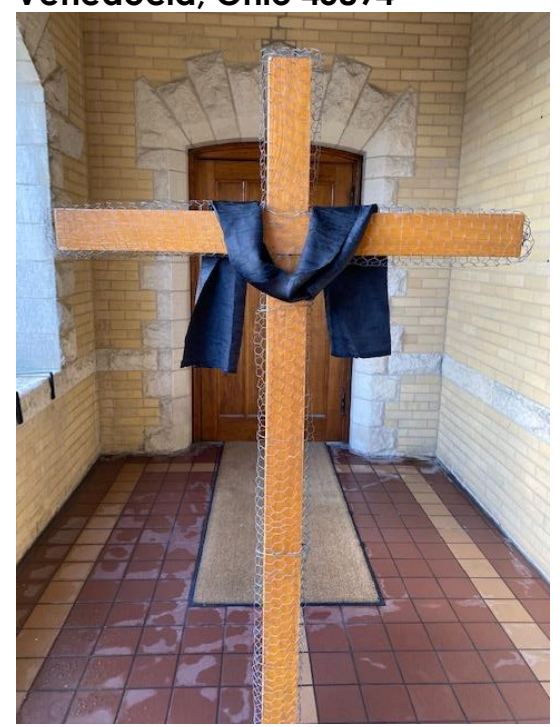
Flowering of the Cross on the church porch in anticipation of the Easter Service