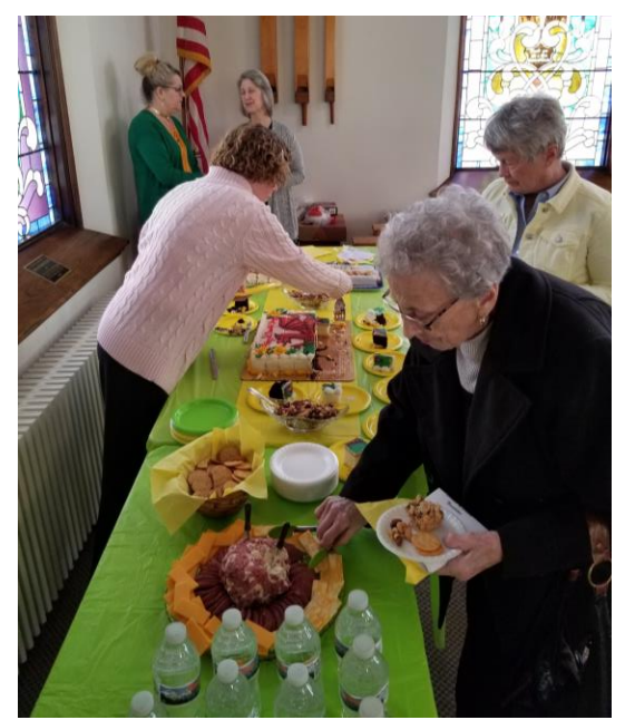
The St. David Day Reception