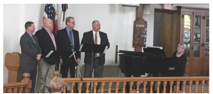
March 1st St. David's Day event visiting quartet